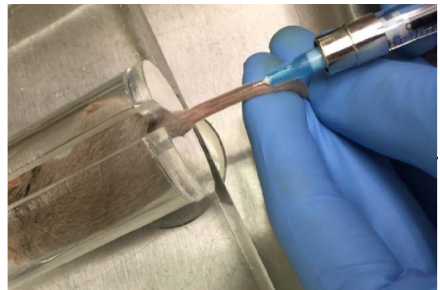
Figure 5 - Subcutaneous Immunization of Emulsion.

注: Chondrex公司不建议使用背部皮下注射注射或腹腔注射胶原乳剂和佐剂，因为乳剂会引起腹腔和胸腔严重的炎症反应。