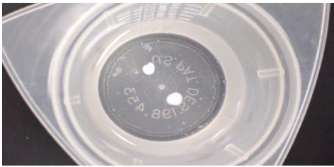
Figure 4 - An intact, stable emulsion on the water's surface 图四 完整稳定的乳剂漂浮在水面

用针头替换三通阀，在装有冰水的烧杯里滴一滴乳剂，检测乳剂的稳定性。如果乳剂是稳定的，如图所示（图四），在水中是成团的，不散开。如果乳剂在水中散开，表明乳剂不稳定，再加几滴佐剂，重新混合再次进行测试。