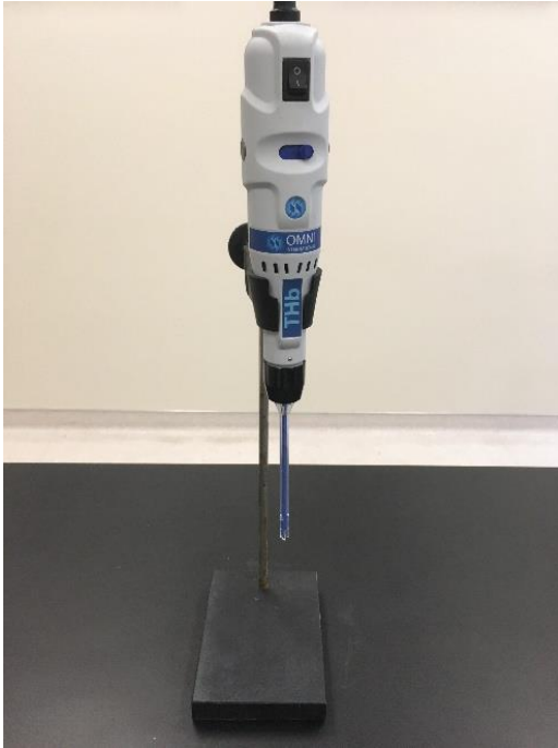
Figure 1 – Homogenizer 图一 高速搅拌器